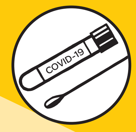
Get a test if you have symptoms