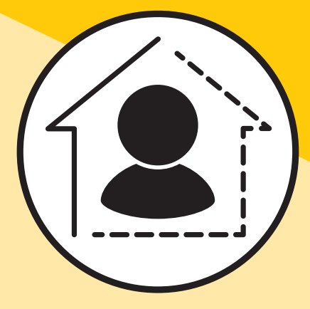
Stay home if you are sick