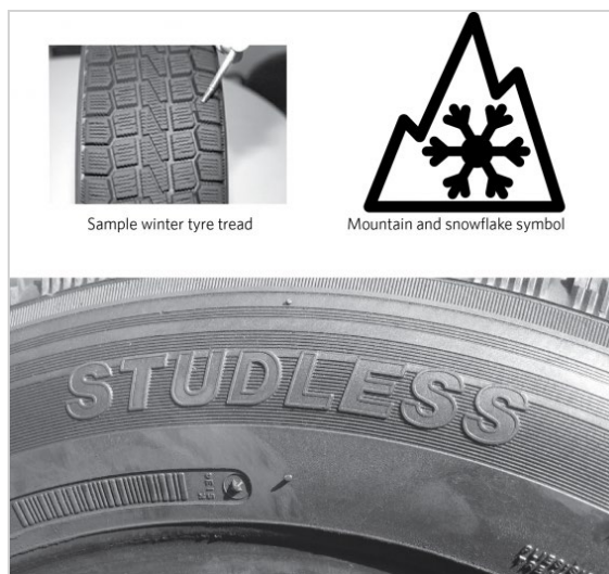
example of winter tyre markings