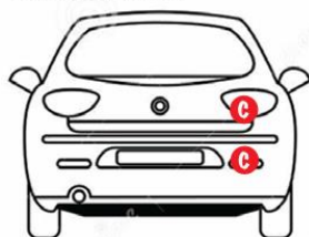
C: Joker Round - Joker Sticker Placement Right hand bumper or Right hand boot