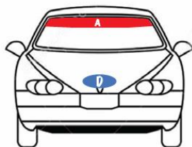
D: Bonnet Sponsor - Placement on centre front of car bonnet