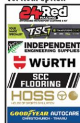
B: Sponsorship logo placement vertical option

Season 10 Sponsorship logo placement guidelines. Choose either a vertical (B) or horizontal (C) option.