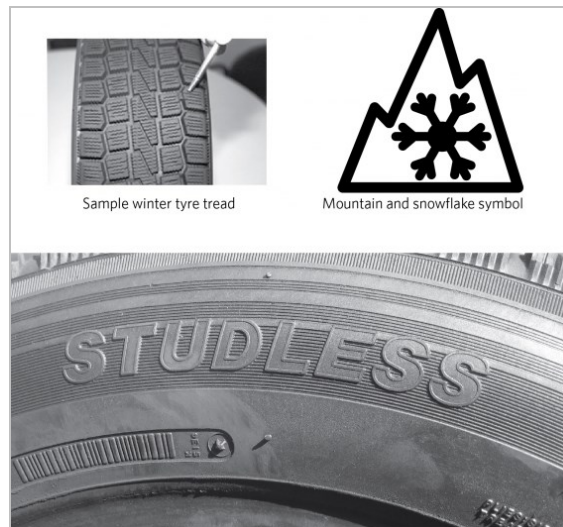
example of winter tyre markings