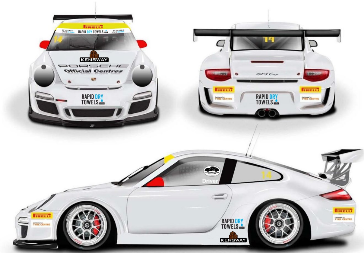
Front window banner - Issued banner may vary