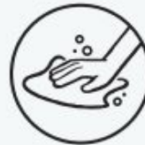
Correct hygiene practices