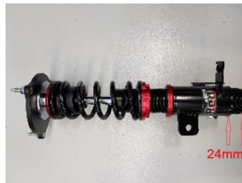
Front Shock Absorber Body Height measuring points