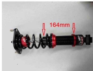
Rear Shock Absorber Body Height measuring points.