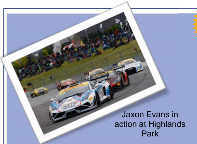
Jaxon Evans in action at Highlands Park

When visiting a racetrack this summer for the Speed Works Series take the time to look out for any of the Class of 2016. You will easily find them, as each graduate will be flying the Elite Motorsport Academy flag out side their respective pit area. Stop in and say hi and support these drivers it means a lot to them.