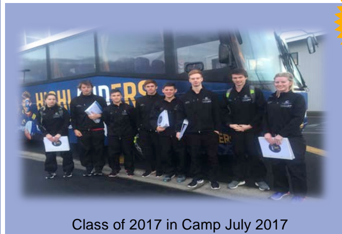
Class of 2017 in Camp July 2017